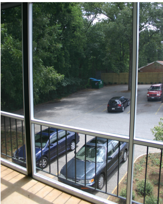
Close-up of the FASTtrack™ System from Screen Tight.